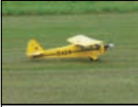
Up, up and away.