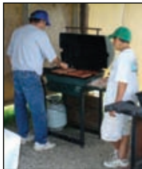
Grillmeister at work.