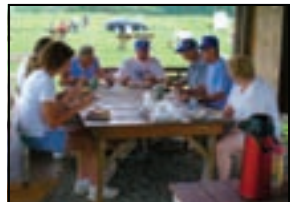
All's well that ends well.