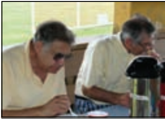
Getting down to business