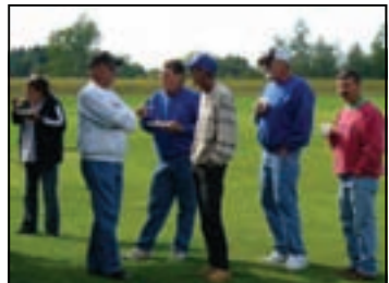
Post flight debriefing