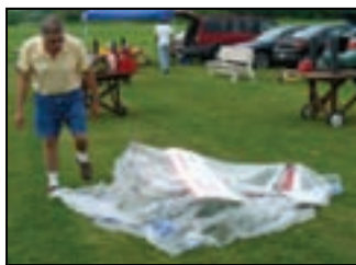
Whew! Just in time.

NICE WEATHER FOR A PICNIC. BUT, SHOWERS ARRIVED AT THE END OF THE DAY.