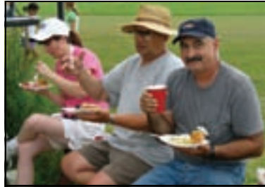
Best part of the day