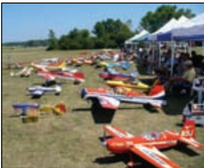
Let the flying begin!