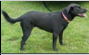
I love this place.