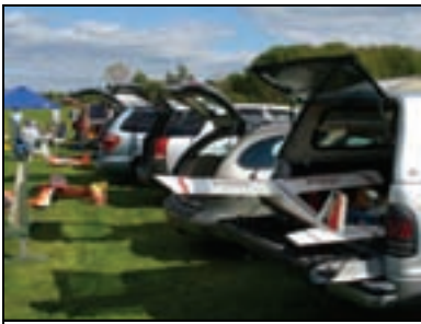
Ok, everybody out!