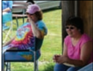
You're kidding, that's a loop?