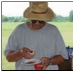
Where'd I put that glo-plug.