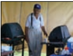
Where are all the folks?