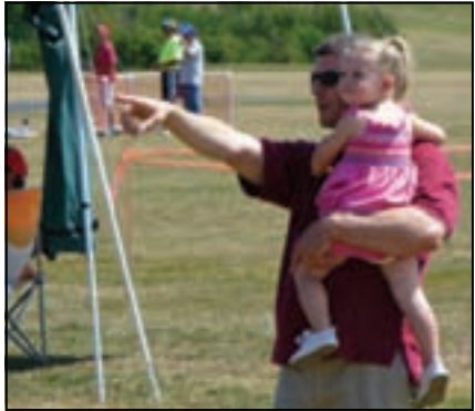
Wow!, Did you see that!

Sunday was a virtual replay of Saturday. Outstanding weather with minimal winds set the tone for the day.