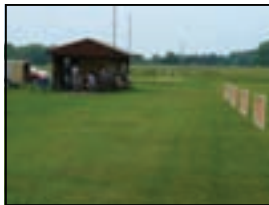
Hello! Anybody home?