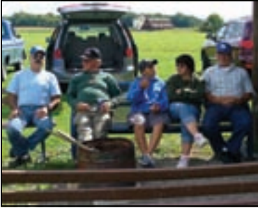
View from the gallery