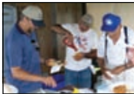
Recipe for disaster!