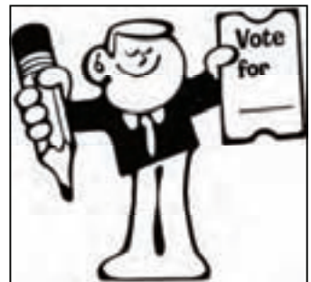
At November's meeting, nominations will be called for.

Consider seriously if you or someone you know would like challenge our incumbents or fill any vacancies that may occur.