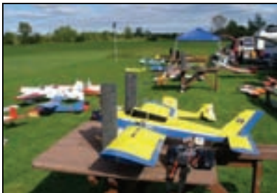
Field of Dreams