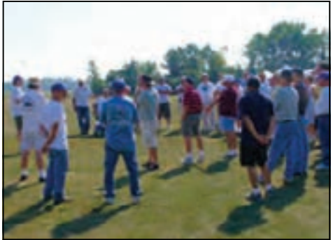
Pre-flight meeting at dawn

Immediately, planes were in the air. Flying continued until around noon when it was temporarily suspended.