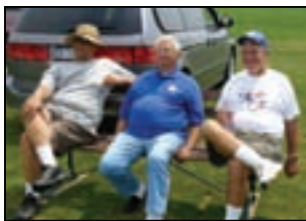
Let's get the show on the road

NICE WEATHER FOR A PICNIC. BUT, SHOWERS ARRIVED AT THE END OF THE DAY.