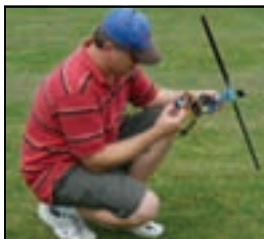
Let's see. It could be..