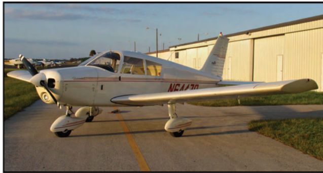
Fig. 1 Piper Cherokee

It introduced the use of similar curves, fiberglass and plastic construction to the small plane market.