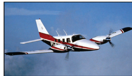
Fig. 3 Piper Seneca

It was the PA-32, better known as the Cherokee Six. In 1967, Piper entered the business field with the PA-31 Navajo, a powerful cabin class twin.