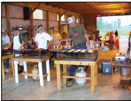
Civil Air Patrol serves breakfast

We have been asked again to provide a few models for a static display in the hanger.