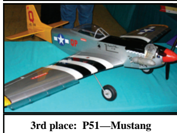
3rd place: P51—Mustang