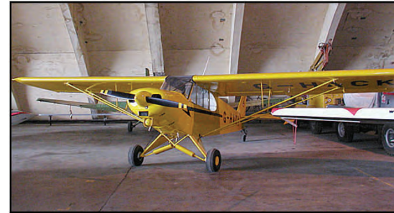
Fig. 2 Piper Cub

This single engine, four place design accounted for more than half of the companies sales in the decades that followed.