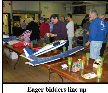
Eager bidders line up

The proceeds of this event are used for field improvements at our North Collins field.