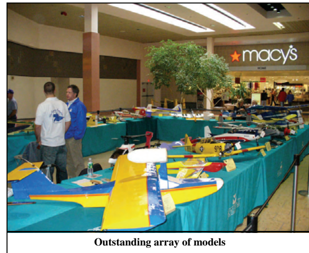
Outstanding array of models

The visitor might pick one simply because it was his or her favorite plane when they were a child.