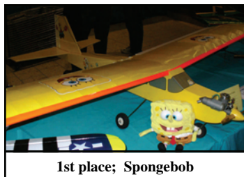
1st place; Spongebob