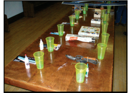
The prizes beckon

One could feel the tempo rising as the moment approached. Prior to the