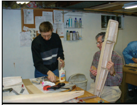
Checking the measurements

in bulk, so the cost was held at a minimum.