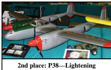
2nd place: P38—Lightening

This years show seemed to run very smoothly and captured a lot of interest from the people shopping the mall.