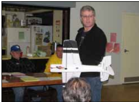
Bill demonstrates principles

For pilots of full scale aircraft, there is both putting in flight time and going to ground school.