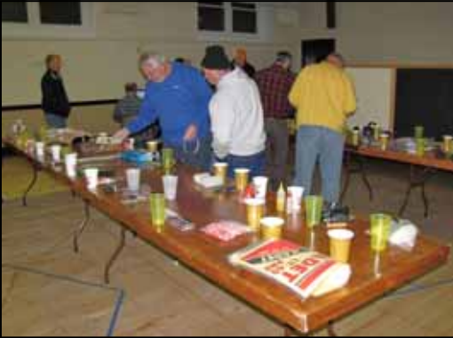
Eager customers survey items

Each cup represented one or more items that had been brought in for the Annual Chinese Auction.