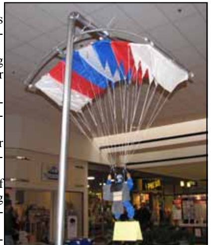
Orv's Hang Glider

The mall show of 2011 was very successful and a large part of that was due to the change in location.