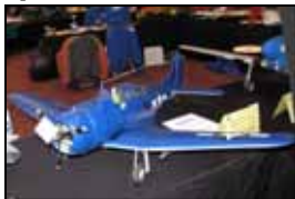
Len Czaplicki “Dauntless”