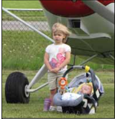
Visitors check out the planes

The breakfast consists of bacon or sausage with scrambled eggs and pancakes.